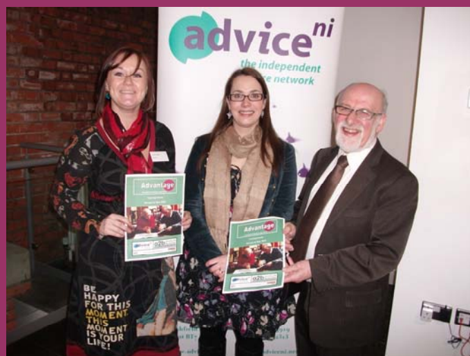
Course tutor and participants with training brochure.