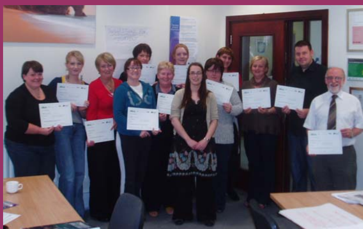
Older Person Adviser Course participants receiving certificates.

"This course was excellent and I have recommended it far and wide. It has really helped me in my work"