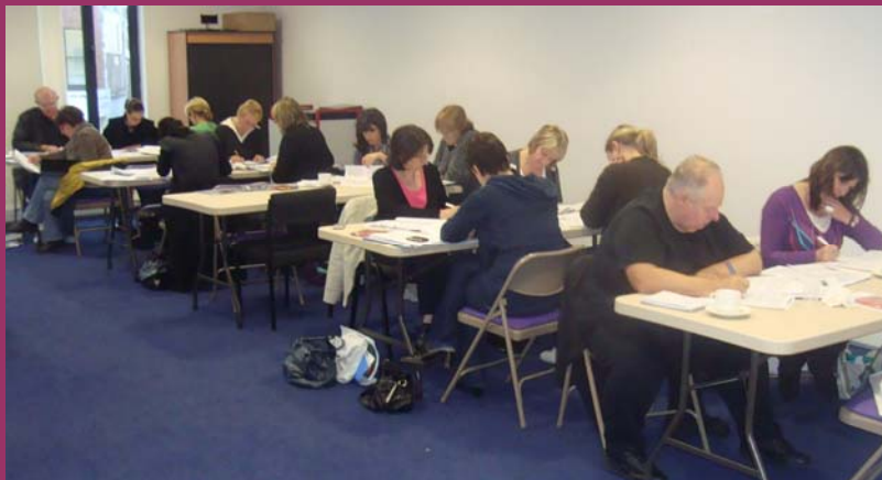
Older Person Adviser Course participants involved in class activities.